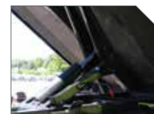
BODY RAISE INDICATOR