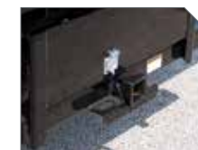
CLASS V RECEIVER HITCH