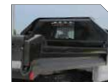
TAPERED QUARTER CAB PROTECTOR