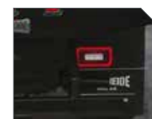
KNAPHEIDE LED TAIL LIGHTS