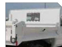
STRAIGHT QUARTER CAB PROTECTOR

'-P' denotes prime paint; '-B' denotes black finish paint.