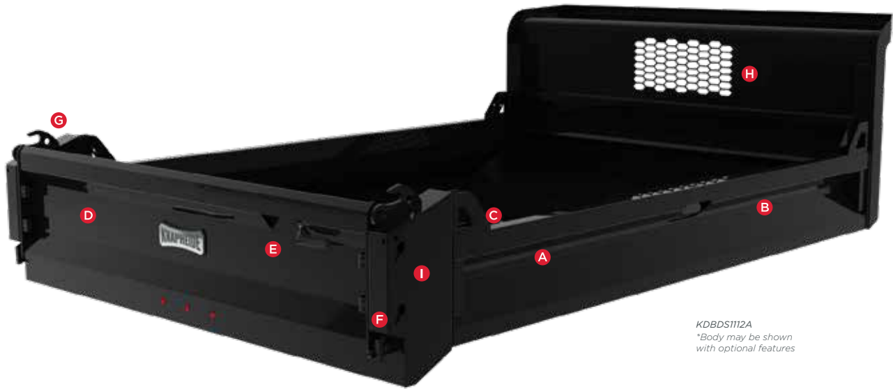
KDBDS1112A *Body may be shown with optional features

H. QUARTER CAB PROTECTOR constructed of 10-gauge high tensile steel with a punched window for visibility