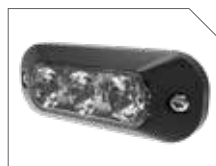
FRONT STROBE LIGHTS