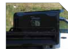
STRAIGHT FULL CAB PROTECTOR