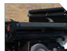
POLY BOARD EXTENSIONS